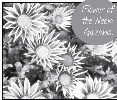
Flower of the Week: Gazania